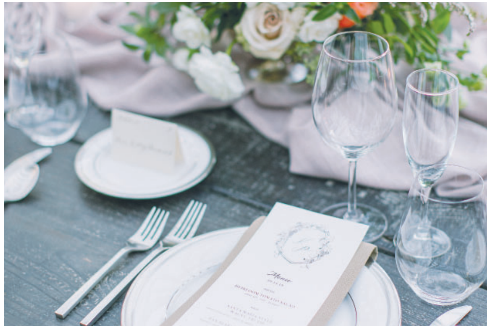
Santa Barbara Wine Country Wedding

And, if you think the traditional church wedding is canceled, this is not the case at the Church of the Good Shepherd. On Aug. 7, the Catholic parish on Roxbury Drive celebrated the first outdoor wedding in its 97-year-history. It was held in the small courtyard of the church, with a dozen people in attendance, all wearing masks. On Aug. 8, another micro-ceremony with seven people