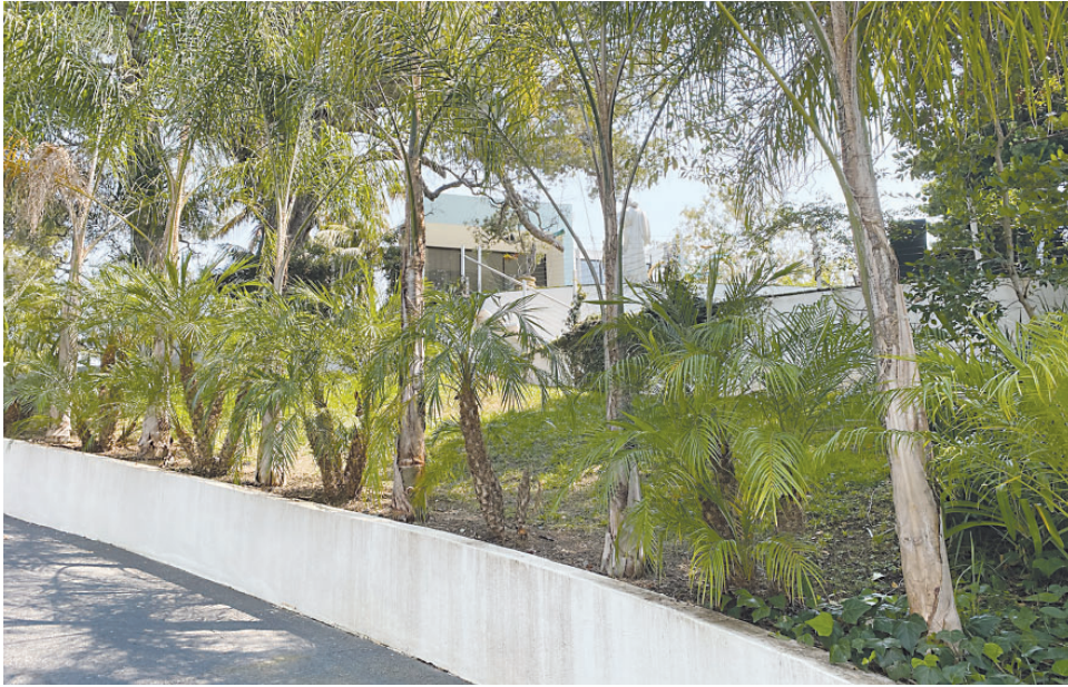
The "Clubhouse" in Beverly Hills