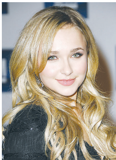
HAYDEN PANETTIERE August 21