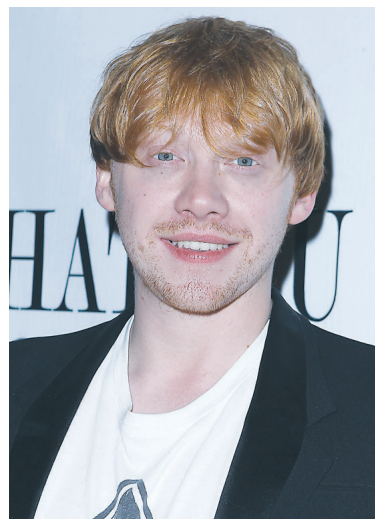
RUPERT GRINT August 24