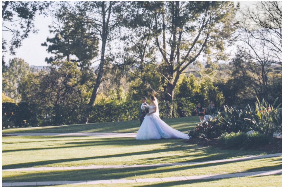
Socially distanced outdoor wedding.

It's supposed to be the happiest day of your life, but COVID-19 has forced the postponement or cancellation of many wedding celebrations scheduled for 2020. Brides and grooms are seeking other alternatives, such as micro-weddings with an intimate small group, or tying the knot with virtual Zoom ceremonies. The Courier spoke with some prominent event planners and experts for tips, advice and guidance.