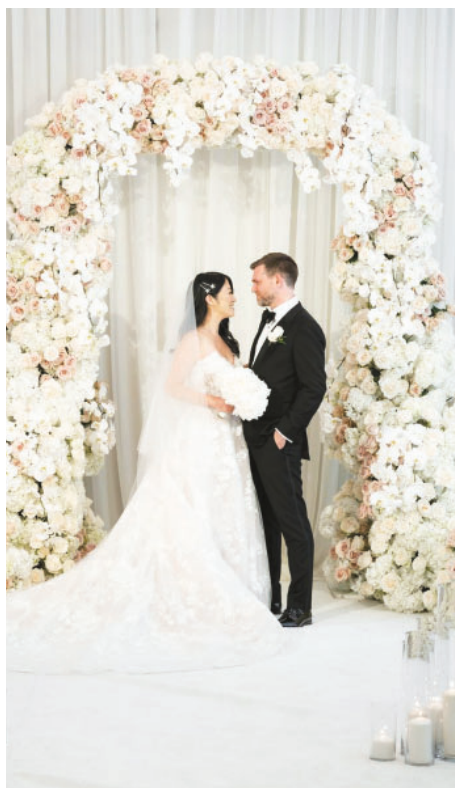
Waldorf Astoria Beverly Hills Virtual Wedding