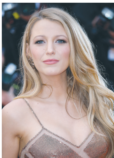
BLAKE LIVELY August 25