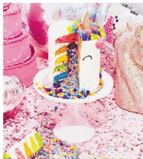
Unicorn Explosion Cake