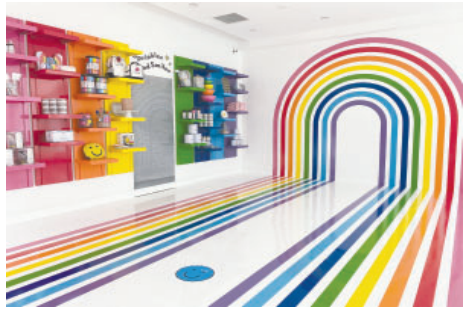
Flour Shop opened on Aug. 17