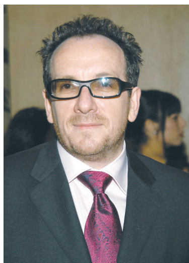
ELVIS COSTELLO August 25