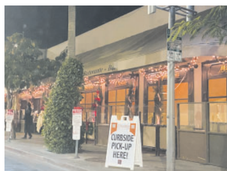
Outdoor dining is returning to Beverly Hills