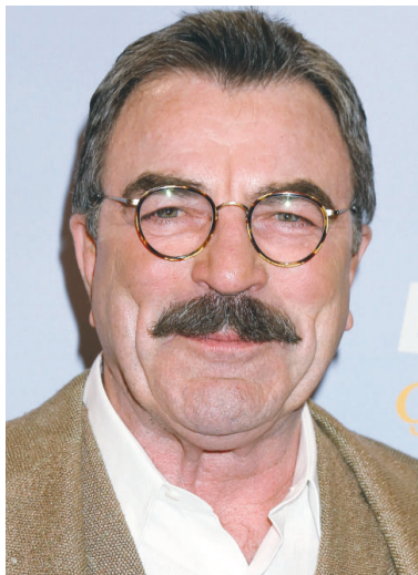
TOM SELLECK January 29