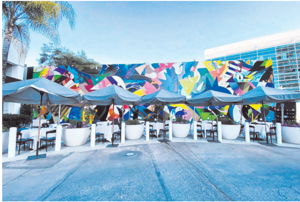
Outdoor tables at SPAGO

Soon after regional stay-at-home orders were lifted by the state, Los Angeles County announced that restaurants could resume in-person outdoor dining operations as of Jan. 29. For restaurant owners and their staff, an industry devastated by the restrictions and closures, the news is nothing short of a lifeline. In a year marked by uncertainty, restaurateurs are exuberant as they prepare to reopen again—hopefully, for the last time.