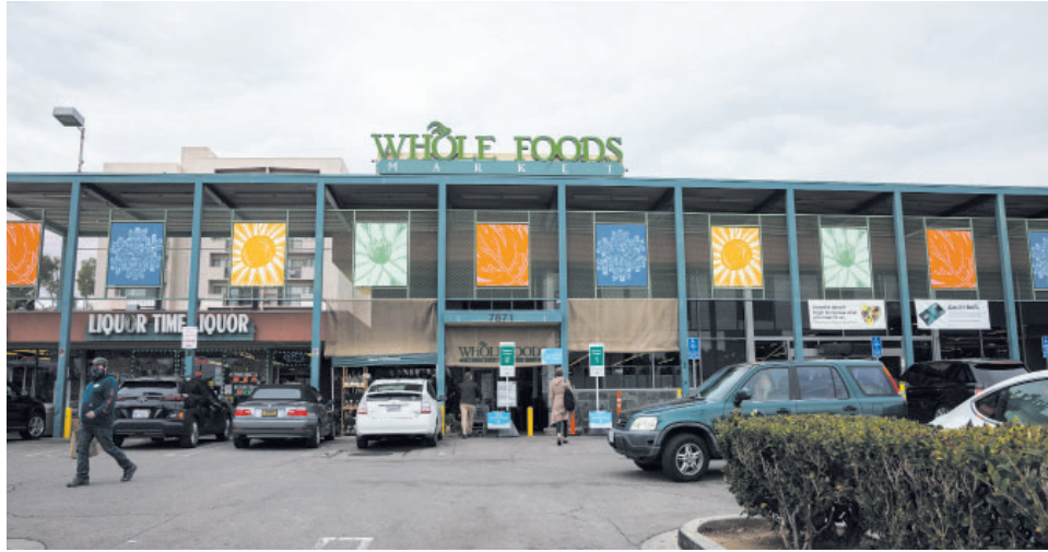
West Hollywood's Whole Foods, where 15 employees have contracted COVID-19

As grocery stores see COVID-19 outbreaks throughout Southern California, the West Hollywood City Council will consider an urgency ordinance that would require hazard pay for frontline grocery workers. The West Hollywood City Council instructed the City Attorney at its Jan. 19 Regular Meeting to