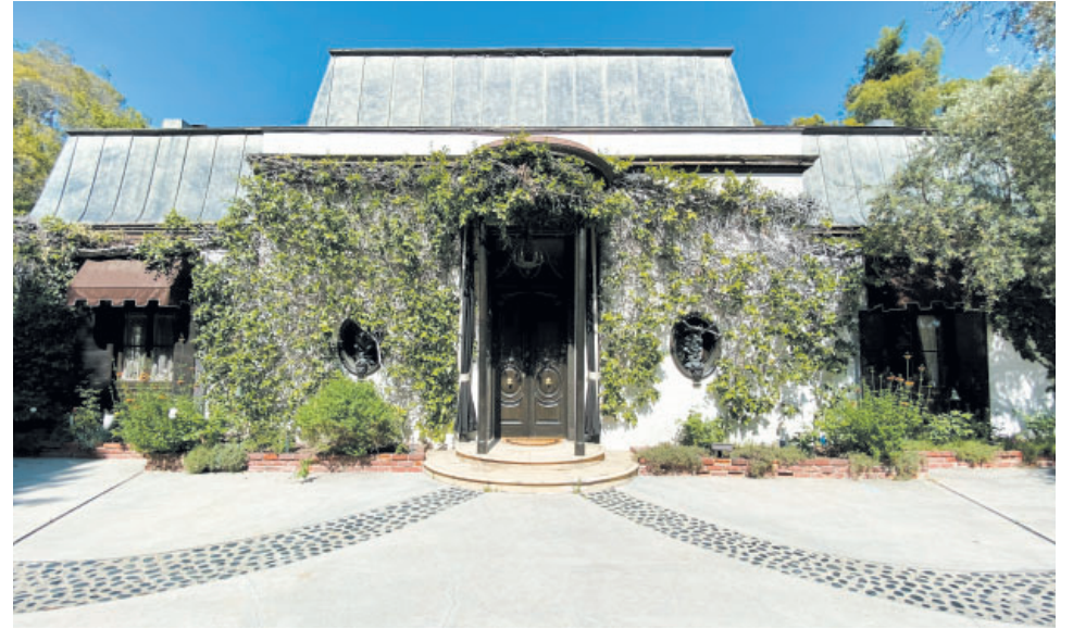
The City Council granted Historic Landmark Status to 1033 Woodland Drive.

To paraphrase Shakespeare, two houses were “not so alike in dignity” at the Jan. 26 Beverly Hills City Council Formal Meeting. One of those houses, at 1033 Woodland Drive, was enthusiastically granted Local Historic Landmark status by the Council. The Hollywood Regency-style house designed by architect John Elgin Woolf was formerly inhabited by Hollywood titan and “The Godfather” producer Robert Evans. In the other matter, the Council unanimously denied an appeal of a lot line adjustment decision for a property in Trousdale Estates. The Council found that the desired adjustment, which would have created a lot that fell in both Beverly Hills and Los Angeles, violated the city’s General Plan. The Council also passed an urgency ordinance prohibiting lot line adjustments across city boundaries.