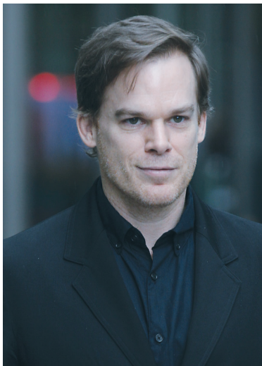
MICHAEL C. HALL February 1