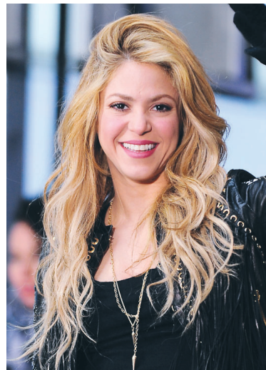
SHAKIRA February 1