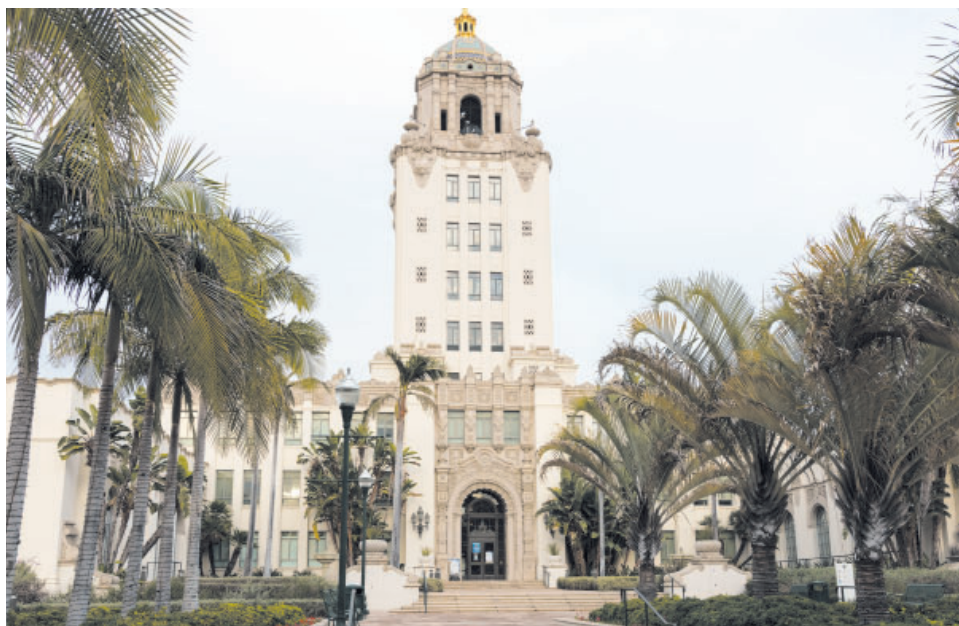
The Beverly Hills City Council took up the issue of term limits