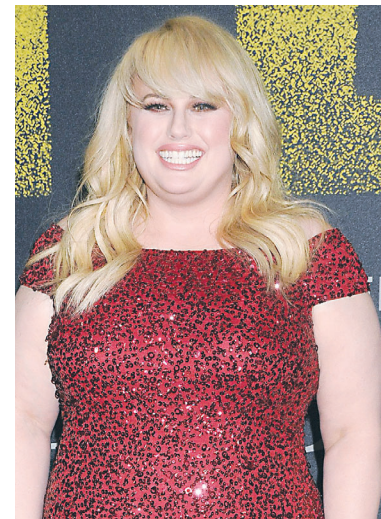
REBEL WILSON February 3