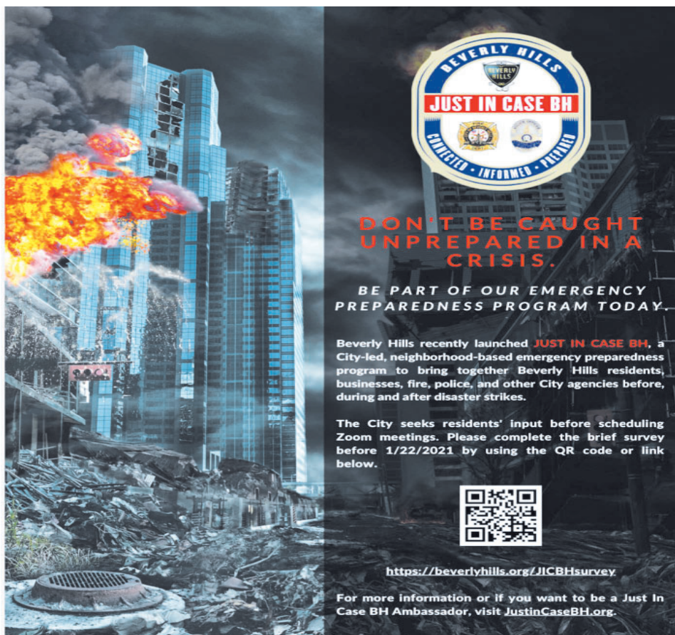
Just in Case BH encourages community preparedness