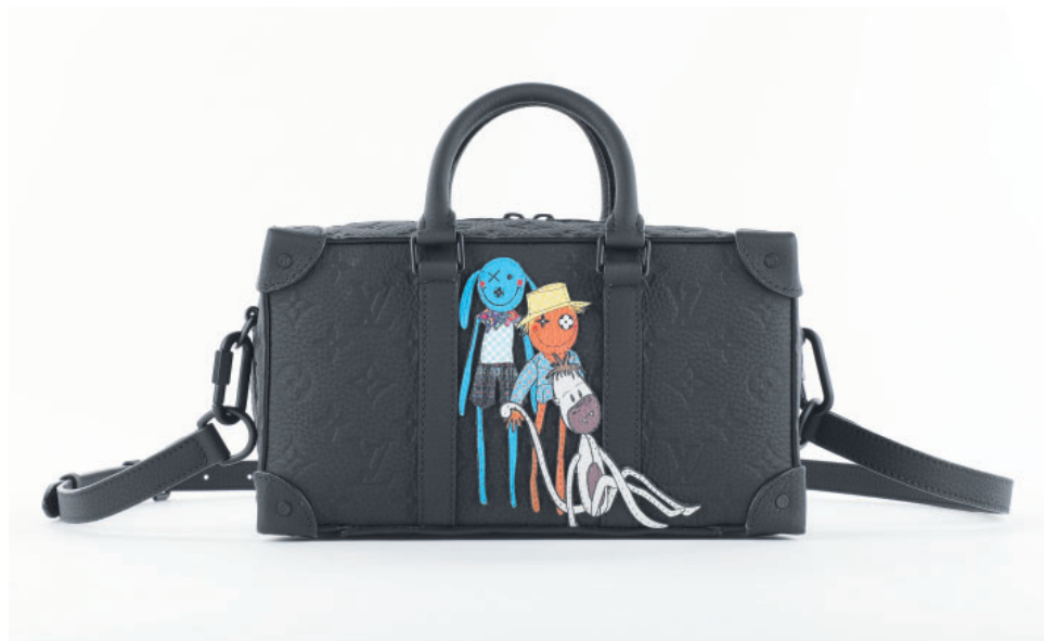
Louis Vuitton Men's Speedy Soft Trunk

Look for a special preview of the installation Feb. 4 on BeverlyHillsCourier.com and in the Feb. 5 print edition of the Beverly Hills Courier. ●