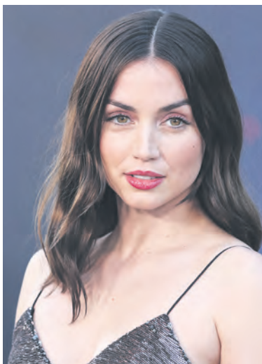
ANA DE ARMAS April 30