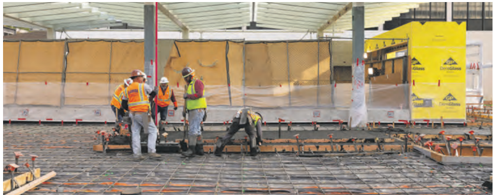
D LINE SUBWAY EXTENSION PROJECT Section 1 – Beverly Hills