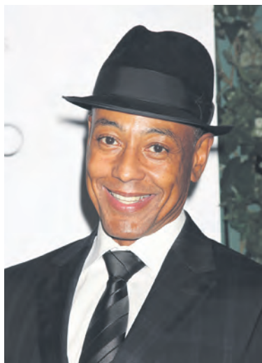
GIANCARLO ESPOSITO April 26