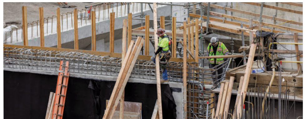
D LINE SUBWAY EXTENSION PROJECT Section 2 – Beverly Hills