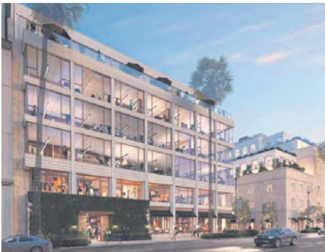
Rendering courtesy Marmol Radziner