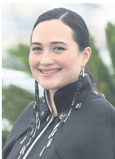
LILY GLADSTONE August 2