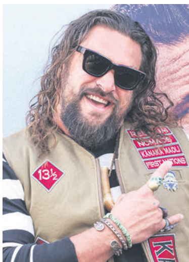
JASON MOMOA August 1