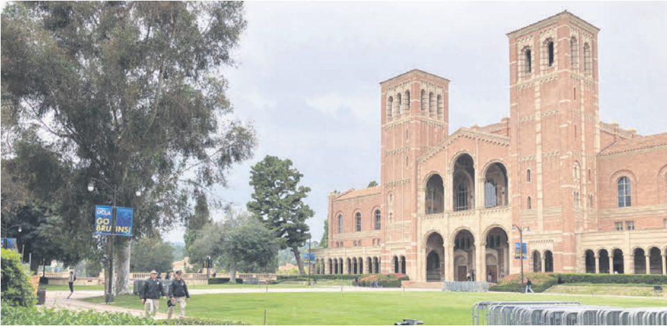
Dickson Plaza at UCLA, where the Palestine Solidarity Encampment was located