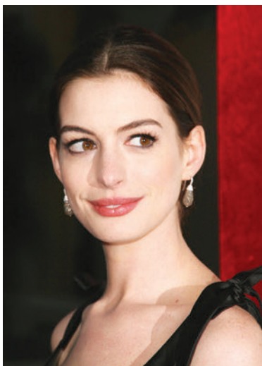
ANNE HATHAWAY November 12