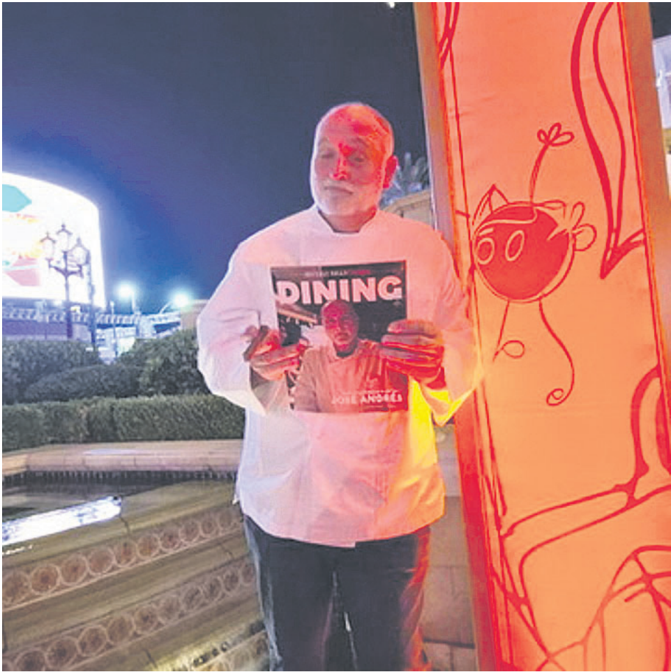
Acclaimed chef José Andrés recently attended the grand reopening of his Bazaar Meat restaurant in Las Vegas. The chef took time to admire his cover profile in the Autumn 2025 issue of Beverly Hills Courier Dining Magazine.