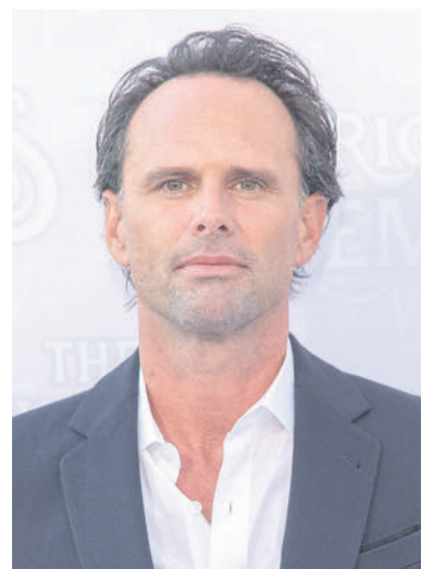
WALTON GOGGINS November 10