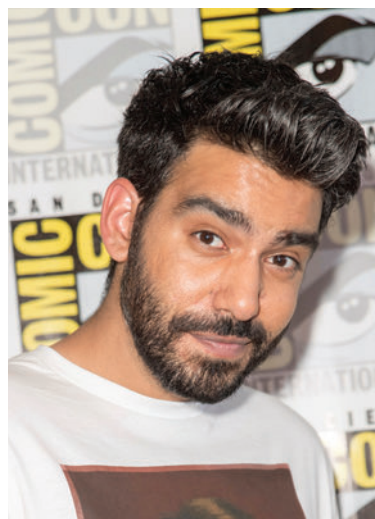
RAHUL KOHLI November 13