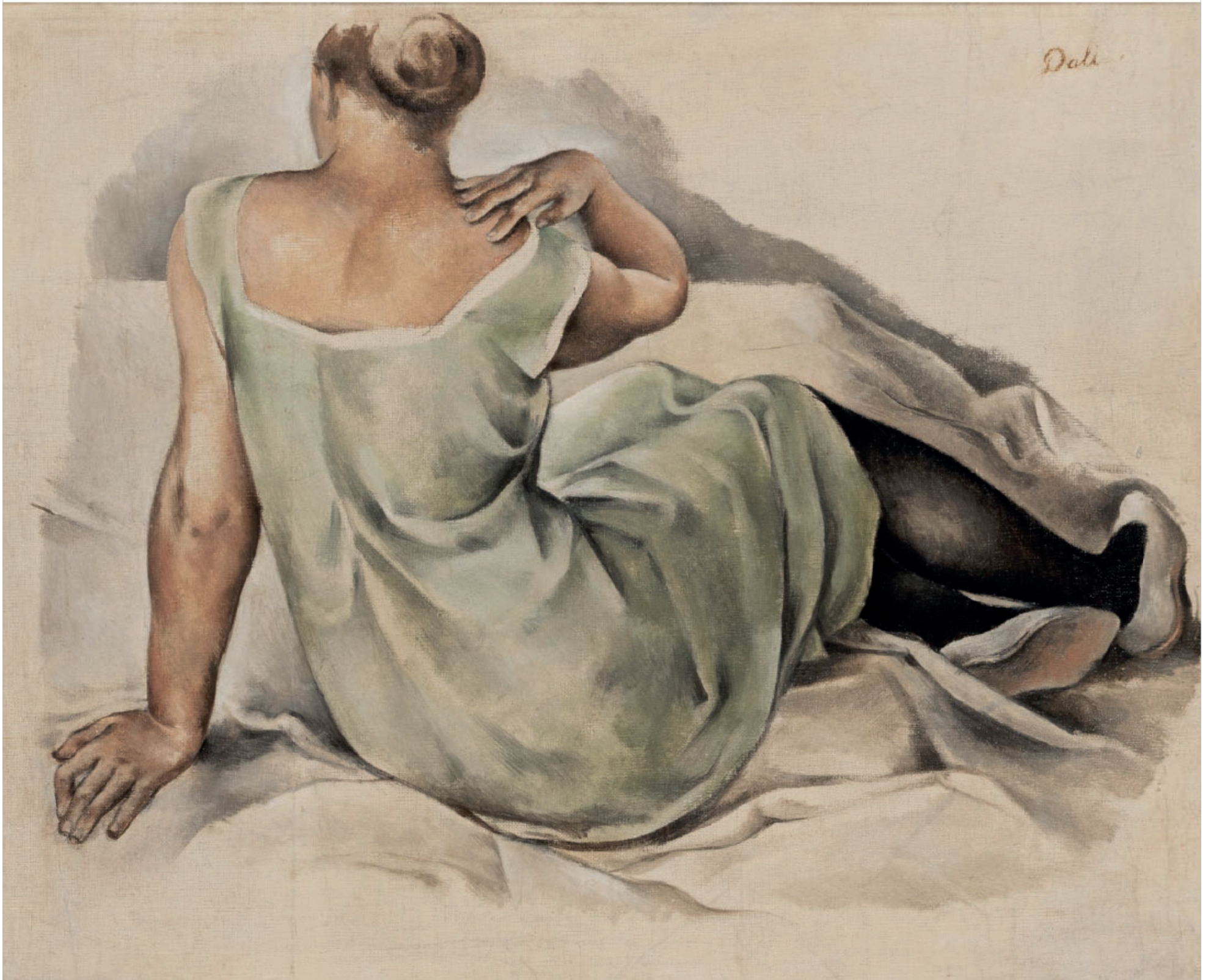
Salvador Dalí, Jeune femme en robe verte à demi-allongée de dos , circa 1925. Estimate $150,000–250,000.

Thursday, November 20 Starting at 11:00am EST