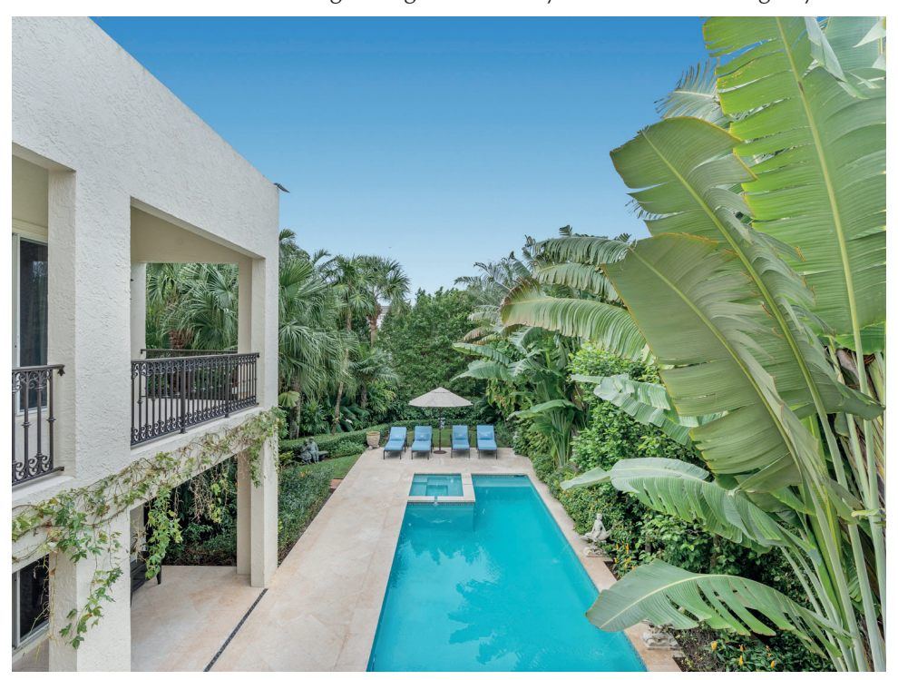
1490 Via Manana, Palm Beach, Florida

Beautifully updated one story home in the Near North End. Featuring 4 bedrooms plus library, 4 baths, powder room, and 2 car garage. This stunning, light and bright home features fantastic open floor plan with eat-in kitchen, dining room, and living room with vaulted ceiling. Stunning hardwood and marble flooring throughout. Primary suite with charming bay windows, dual walk-in closets, and stunning bath. I Exclusive Offering