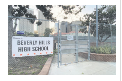
Beverly Hills Art Show Takes Place Oct. 21-22 6

Worker Killed at Beverly Hills High School Construction Site 5