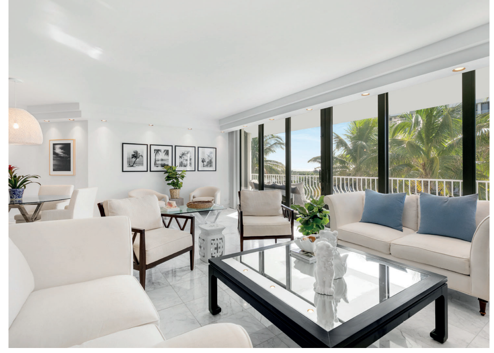
2000 S. Ocean Boulevard 107N, Palm Beach, Florida Light and bright 2BR/2.1BA condo. Nice views, open floor plan, wet bar, and spacious great room perfect for entertaining. I Exclusive Offering

Gorgeous 4BR/5.1BA Contemporary Mediterranean home on a fantastic, oversized lot. This property is a private and peaceful oasis. I Exclusive Offering