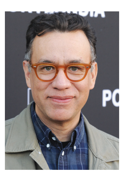
FRED ARMISEN December 4