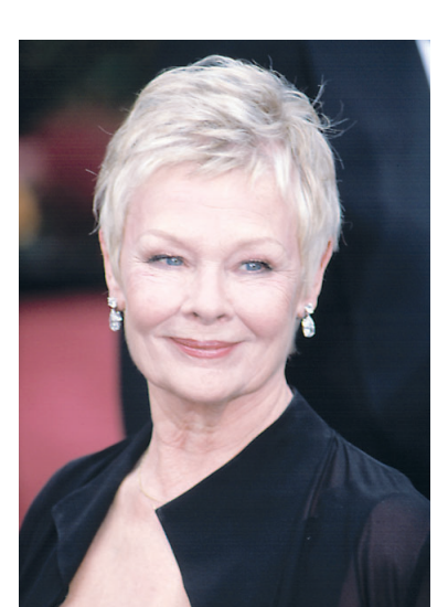
DAME JUDI DENCH December 9

wouldn't have guessed. Strangely, everything doesn't hinge on one element and yet altering one element can still change everything.