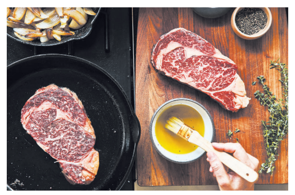
First Light Steak Club

For a sumptuous gift basket, Eataly at the Westfeld in Century City has an array of condiment baskets for any cook or Italian food lover. Two great finds for bringing to