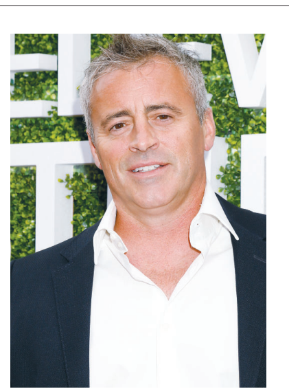
MATT LEBLANC July 25