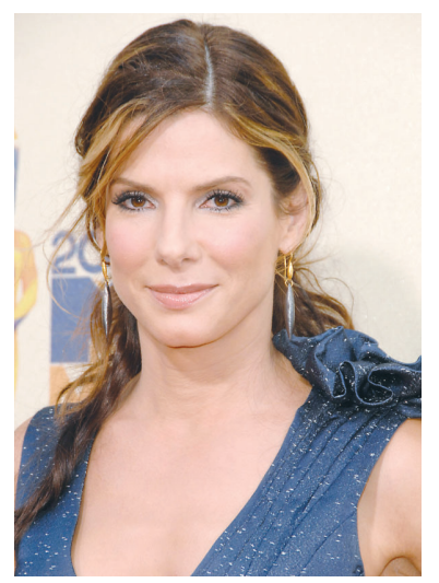
SANDRA BULLOCK July 26