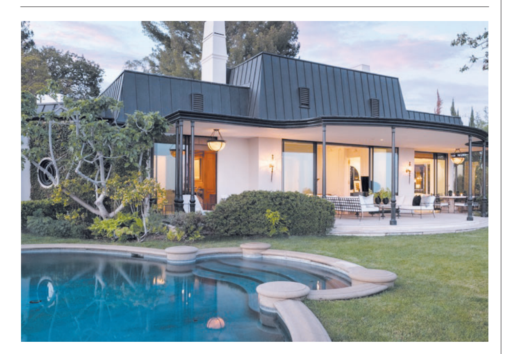
The Cultural Heritage Commission voted to initiate historic landmark proceedings for 1010 Hillcrest Road.

(Trousdale Estate continued from page 5)