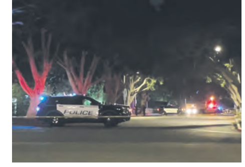
Police officers at the scene of a burglary investigation on the 1300 block of Park Way on Oct. 30

At the Nov. 1 City Council Study Session, Beverly Hills Police Department (BHPD) Chief Mark Stainbrook reported a 34% decrease in crime since the launch of the Real Time Watch Center (RTWC) in June. Unveiled by Mayor Lili Bosse at her installation in April, the RTWC uses state-of-the-art technology to monitor the city's sprawling surveillance network 24/7, which includes nearly 2,000 CCTV cameras, automatic license plate readers (ALPRs) unmanned aerial systems (drones), a fusion cell and Live911, a new system that allows officers to hear emergency calls live in the field as they come in and immediately respond without having to wait for instructions from dispatch. With nearly half a million dollars approved by the City Council to establish the surveillance hub in April, BHPD has since trained Virtual Patrol Operators from Covered 6 and Nastec International in CCTV monitoring,