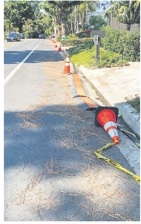
SCE repairs in progress in Trousdale last month

According to Gonzales, the outage on Oct. 24 happened during ongoing construction on the Harratt, Playboy, Roxbury, Maple, and Hilton power circuits that is expected to end in early 2023. At 5:08 p.m., 2,215 customers lost power when work near Doheny Drive and Loma Vista Street caused three circuits to shutter. Around half of the See SCE, page 13