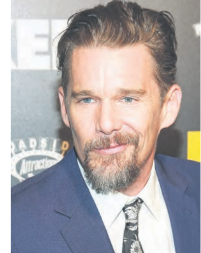
ETHAN HAWKE November 6

PLEASE SEND THE PHOTOS WITH AT LEAST TWO WEEKS NOTICE TO: EDITORIAL@BHCOURIER.COM