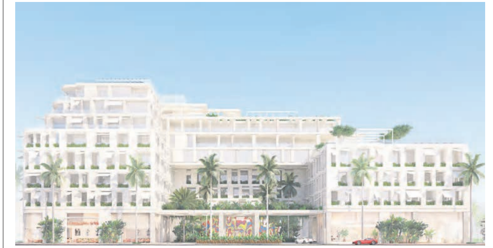
Rendering of the Cheval Blanc facade