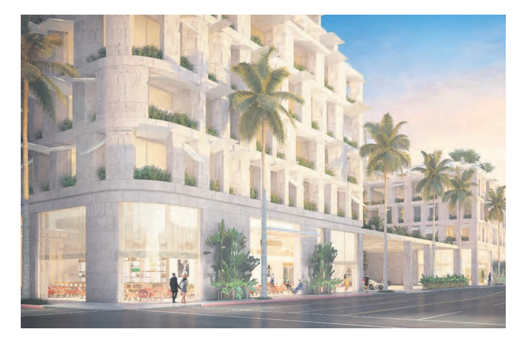
Renderings of Cheval Blanc Left: Corner view, Right: Pool Roof

Questions? Comments? Concerns? The Courier wants to hear from you! Email: editorial@bhcourier.com