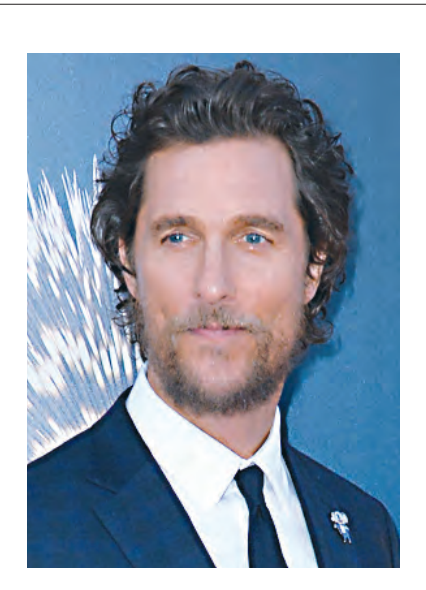
MATTHEW MCCONAUGHEY November 4