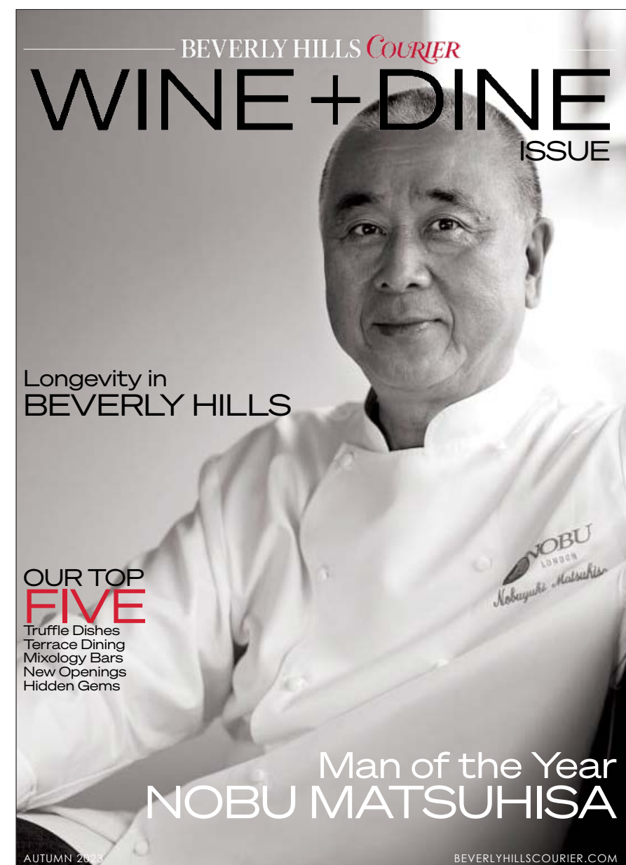
WINE + DINE ISSUE AUTUMN 2023

If you would like to be a part of this exciting publication, please reserve your ad space by July 14.